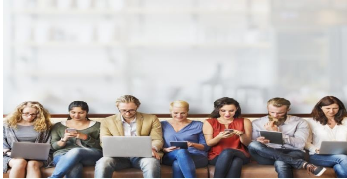
Figure 5: ‘Always ON’ society due to technology

The nature of communication has changed along with its increase in speed and volume. Mobile devices that fit in our pockets have tiny keyboards that make expedient communication desirable; hence an increase in the use of shortcuts, symbols, abbreviations, and new words that get the point across with fewer characters. A multiplicity of devices has also made communication fast like smart phone, laptop, tablet, or desktop. The tools give teams access to each other's edits and comments on the same document or spreadsheet, facilitating communication and collaboration toward common goals. While technology is often seen as the culprit behind a decline in face-to-face talking, we have to give credit to technology for opening up many new avenues for expanding the comparatively limited communication options we had available in the past.