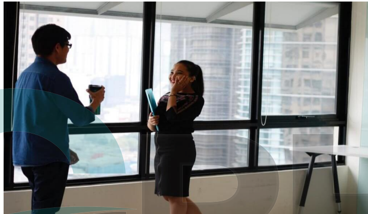
Figure 4: Powering richer inclusivity

Technology is widely misconstrued as the only amicable solution to our problems in the workplace, but if you are going to bring in new HR technology, you need to make sure that the technology prioritizes the individual, and not the other way round. The individual needs to be at the center of all conversations to build a better workplace as it pays more dividends. The productivity levels of those organizations who manage to engage their employees more rise up by 22%, compared to those who don't, according to a survey by Gallup.