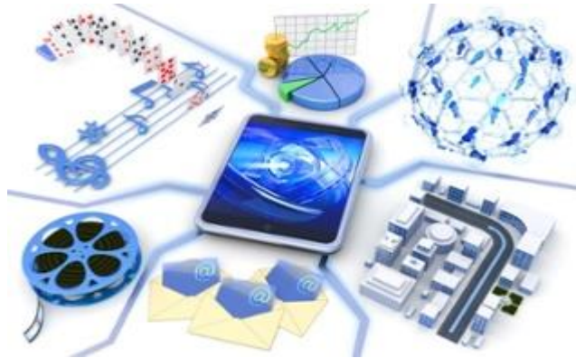
Figure 1: Digital transformation of workplace

Digital transformation means many different things to different people. In general, we think of it as the transformation of business activities and processes to leverage digital technologies. But technology in itself is not the answer – to be meaningful, it is more of a way of doing things rather than the thing itself. There is no shortage of new digital technologies to invest in, from social, mobile, big data, cloud, Internet of Technologies, etc. Often the rush to fix a one-off problem results in a solution that is not integrated with the rest of the business infrastructure – including the employees themselves. The promise of a digital workplace that is more agile, productive and responsive is terrific, but to successfully transform it means a real focus on the human elements.